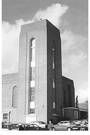
OUR LADY. QUEEN OF APOSTLES